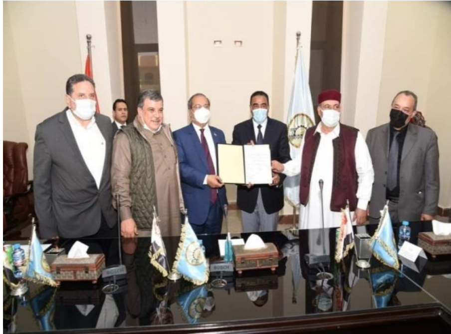
Signing the protocol and launching the re-volving loan activity